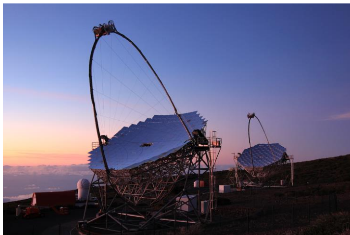
MAGIC (Major Atmospheric Gamma-Ray Imaging Cherenkov) are the world's largest air-Cherenkov-telescopes each with a diameter of 17m.

The telescopes in the north of the island are currently not threatened by the volcanic eruption, as the volcano is located in the south of La Palma.