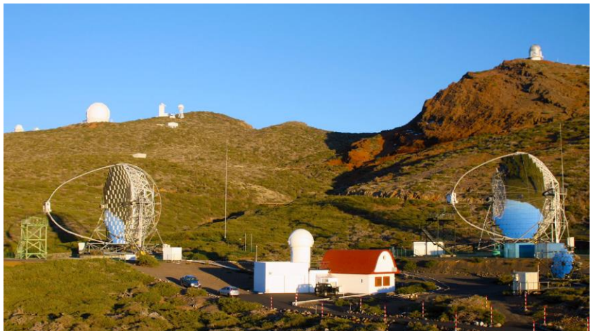
The twin telescope MAGIC at an altitude of over 2200m on the island La Palma.

"We found that these cards not only had the lowest levels of spurious signals and crosstalk of all the PC cards that we tested," said David Fink from the Max Planck Institute for Physics, who is in charge of Electronic Development on the project, "but the performance of each card was also identical. The latter is so important as you are trying to compare the differences between the signals from each telescope. The technique is very sensitive to correlated signals and crosstalk between channels including anything picked up along the way from the optical sensors through to the computer that the digitizer cards are mounted in. To put it into perspective, these Spectrum cards enable us to precisely measure fluctuations of the light intensity on nanosecond time scales giving unprecedented sensitivity that is around ten times better than that achieved in the 1970s with the Narrabri interferometer."