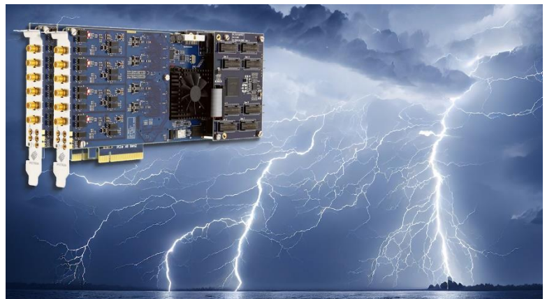
Two M4i.4451-x8 digitizers synchronized for lightning research