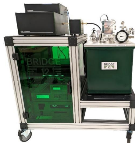
Smaller, lighter, cost-effective: The EPR spectrometer by Bridge 12 opens this technology to many more scientists

Spectrum Instrumentation Corp., USA Phone: (201) 562-1999 Email: Sales@spectrum-instrumentation.com