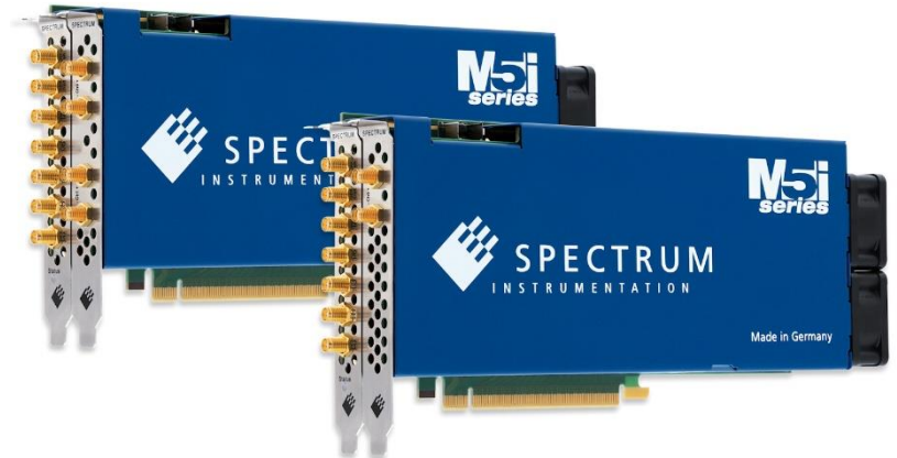
The new flagship AWGs are available with one or two output channels, which can be used single-ended or differential (see front panel on the right).

For easy system integration, the front-panel hosts four multi-function SMA connectors. These can perform a variety of Input/Output tasks like Asynchronous Digital-I/O, Timestamp Reference Clock Input, Synchronous Digital-Out, Trigger Output, Run and Arm status flags, or the System Clock. By switching the multi-function I/O lines to digital outputs, another four synchronous output channels can be added to the AWG. As such, a single AWG card can generate up to two analog and four digital outputs, in parallel, at full speed. As an option, a Digital Pulse Generator firmware is available to turn the four digital outputs into digital generators outputs. All these features are very helpful when interfacing with other equipment for experiment control or in OEM projects.