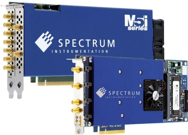
The digitizer flagship M5i.3357 with 10 GS/s sampling rate and 12 bit resolution and the bestseller AWG M4i.6631 with 1.25 GS/s output rate and 16 bit resolution.

performance / price. And lastly, the five-year warranty provides peace of mind that a critical component of the research is good for five years as it is almost impossible to obtain funding to replace a failed piece of equipment.