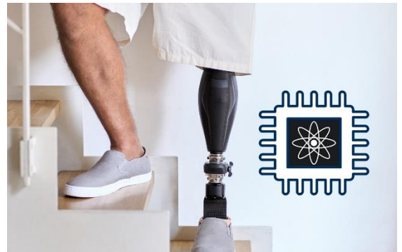
Quantum sensors on the skin instead of electrodes inside the body - the new aim for moving prosthetics